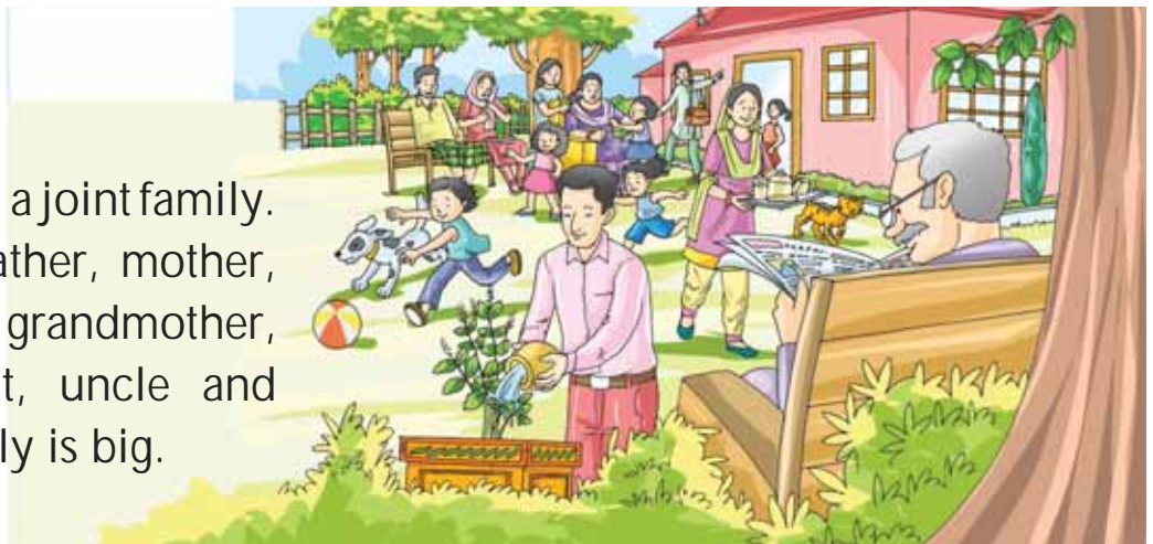
A Big Family